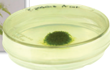
Figure 1 (left) P. patens leafy gametophyte. Figure 2 (above) Protonema used for liquid culture. Figure 3 (below) Leafy gametophytes on agar plate