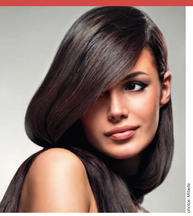
New active ingredient reduces hair loss and helps increase hair density

s consumers continue to strive towards being healthy and maintaining good looks as they age, they do not only focus on skin care but also on anti-ageing hair care. Ageing of the hair comprises different aspects: thinning of hair, hair loss, dullness, colour fading and greying are all part of this process. While grey hair has gained acceptance, thinning hair will always be perceived as negative and, therefore, hair care products with antihair loss claims are of growing interest to everyone.